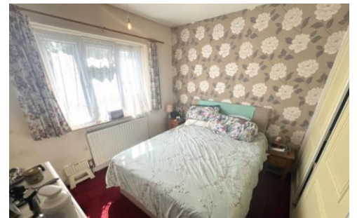
Alexandra Close , Harrow, , HA2 8QA